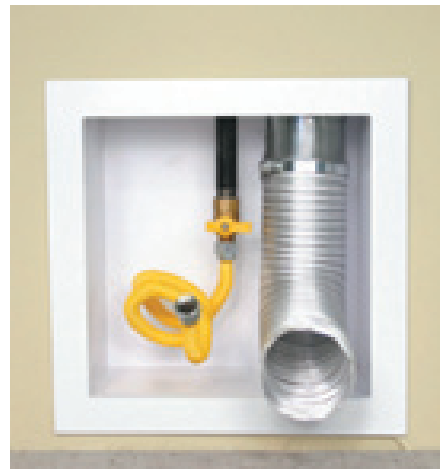
Recess the connection for your clothes dryer, refrigerator, TV, water and gas appliances.

Bemis and Brondell each offer either full bidet and/or washlet models.