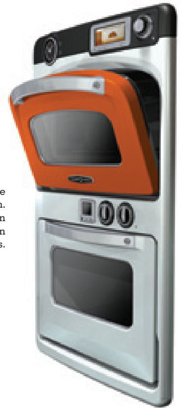
Check out the Intelligent Oven. A double oven with refrigeration capabilities.

Is that a dresser or a vanity? One of the hottest trends in bathrooms today is the free-