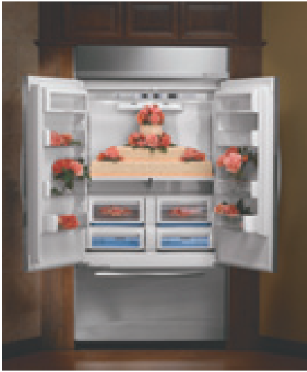
The French door refrigerator

All steamed up. Steam jets in your bathroom can be a source of ultimate relaxation but steam in your kitchen translates into healthy cooking and succulent meals. Steam can be found in built-in wall ovens from Gaggenau, Kitchen Aid (early 2007), Miele and Sharp (early 2007), counter-top units from Sharp and as part of a free standing range by Kitchen Aid. You can find some of units on display at Nielsen's Appliance and Schmidt's Appliance.